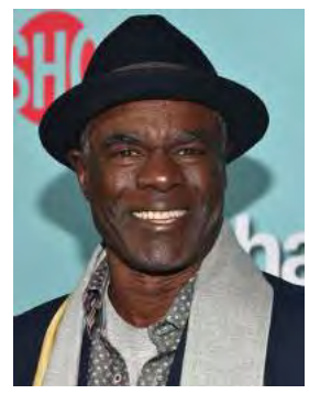
Glynn Turman - Super 8