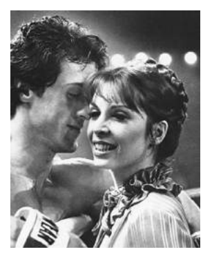
Talia Shire - Rocky